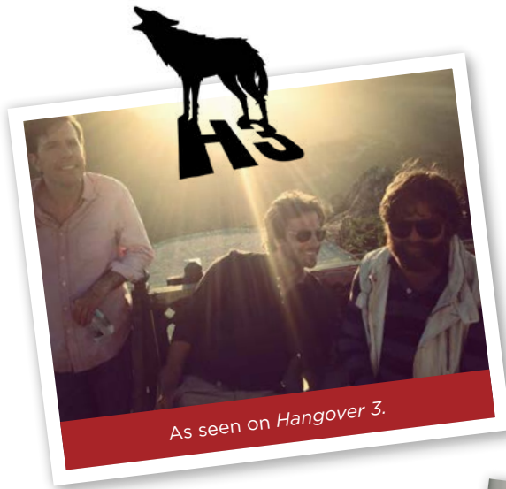
As seen on Hangover 3.