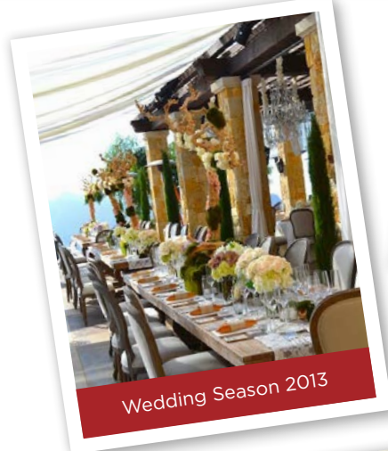
Wedding Season 2013